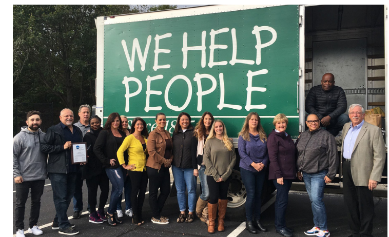
(Clockwise from Top Left): Adelphi University; People's Alliance Federal Credit Union; Voxx International Corp.; Teachers Alliance Federal Credit Union