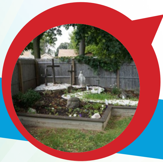
Reflection Garden at Dismas House

Anthony House and Dismas House are the Society's homes for men in transition. Whether burdened by addiction, chronic unemployment, criminal past, or other challenging circumstances they all share the drive to improve their station in life. Men are provided with resources to help find jobs, remain sober and learn the life skills necessary to be successful.