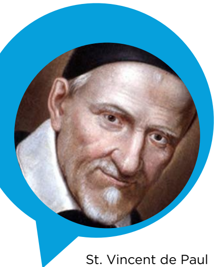
St. Vincent de Paul Vincent de Paul, who died in 1660, was declared Patron Saint of all works of charity by Pope Leo XIII and was canonized June 16, 1737.

The Society of St. Vincent de Paul is the only organization on Long Island that provides “home visits” as its core service model. This practice is the defining symbol of Vincentian commitment and the ultimate respect for our neighbors in need. By assisting families in their homes, the Society reaches out beyond the scope of social services and into the homes and hearts of those seeking aid, providing a safe place for them to confide their stories of struggle. The Vincentian Spirit is the driving force behind the Society of St. Vincent de Paul and the reason why the organization has been in existence for 180 years. The essential elements that define members of the Society of St. Vincent de Paul are Spirituality, Friendship, and Service. By becoming personally involved in helping the poor, Vincentians follow Christ and bear witness to His compassionate and liberating love. In turn, the poor provide Vincentians with an opportunity to fulfill their purpose and live out their commitment to Christ.