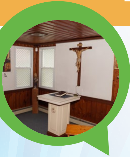
Chapel at Anthony House

Anthony House and Dismas House are the Society's homes for men in transition. Whether burdened by addiction, chronic unemployment, criminal past, or other challenging circumstances they all share the drive to improve their station in life. Men are provided with resources to help find jobs, remain sober and learn the life skills necessary to be successful.