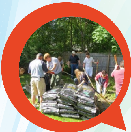
Young Vincentians ban together to create a reflection garden at Dismas House