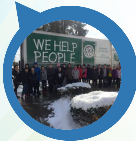
Students from St. Isidore's Elementary School collected toys for our Christmas drive